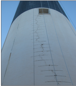
North side cracks