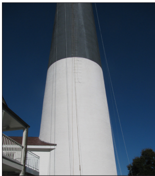
Ground level view