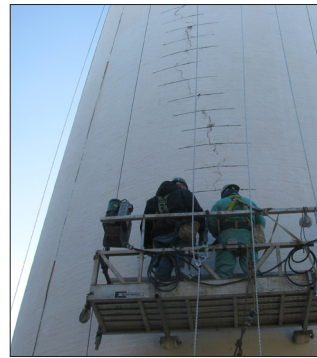
International Chimney Corp. associates inserting V2 CFRP Biscuits and V2 100 Epoxy Paste