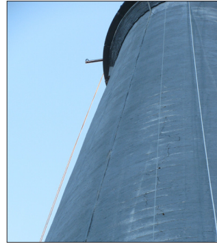
South side cracks